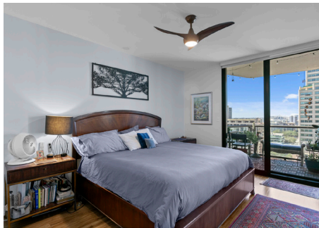
The primary bedroom has an en suite bath with dressing area.