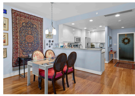
The open floor plan has plenty of space for living and dining areas.