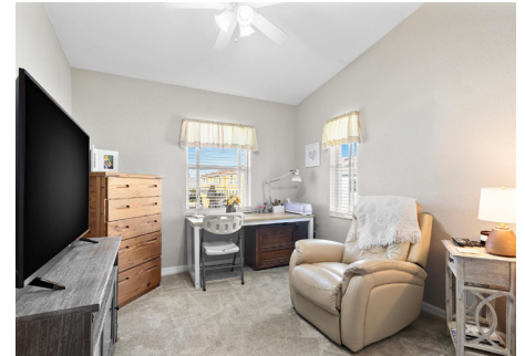
Two other bedrooms offer plenty of space, with a shared hall bath.