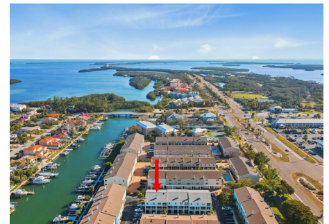
Enjoy the community pool, nearby Fort DeSoto Park and much more!