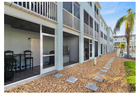
Two screened patios - one on the main living level, one downstairs.