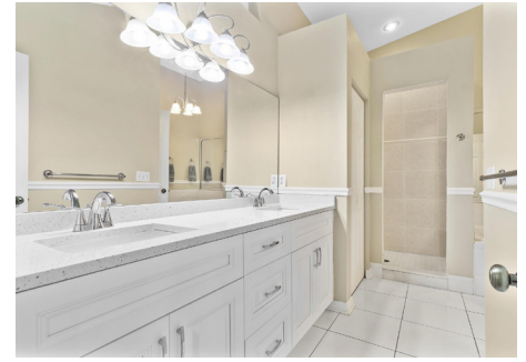
The primary bedroom has an en suite bath with whirlpool tub and shower.